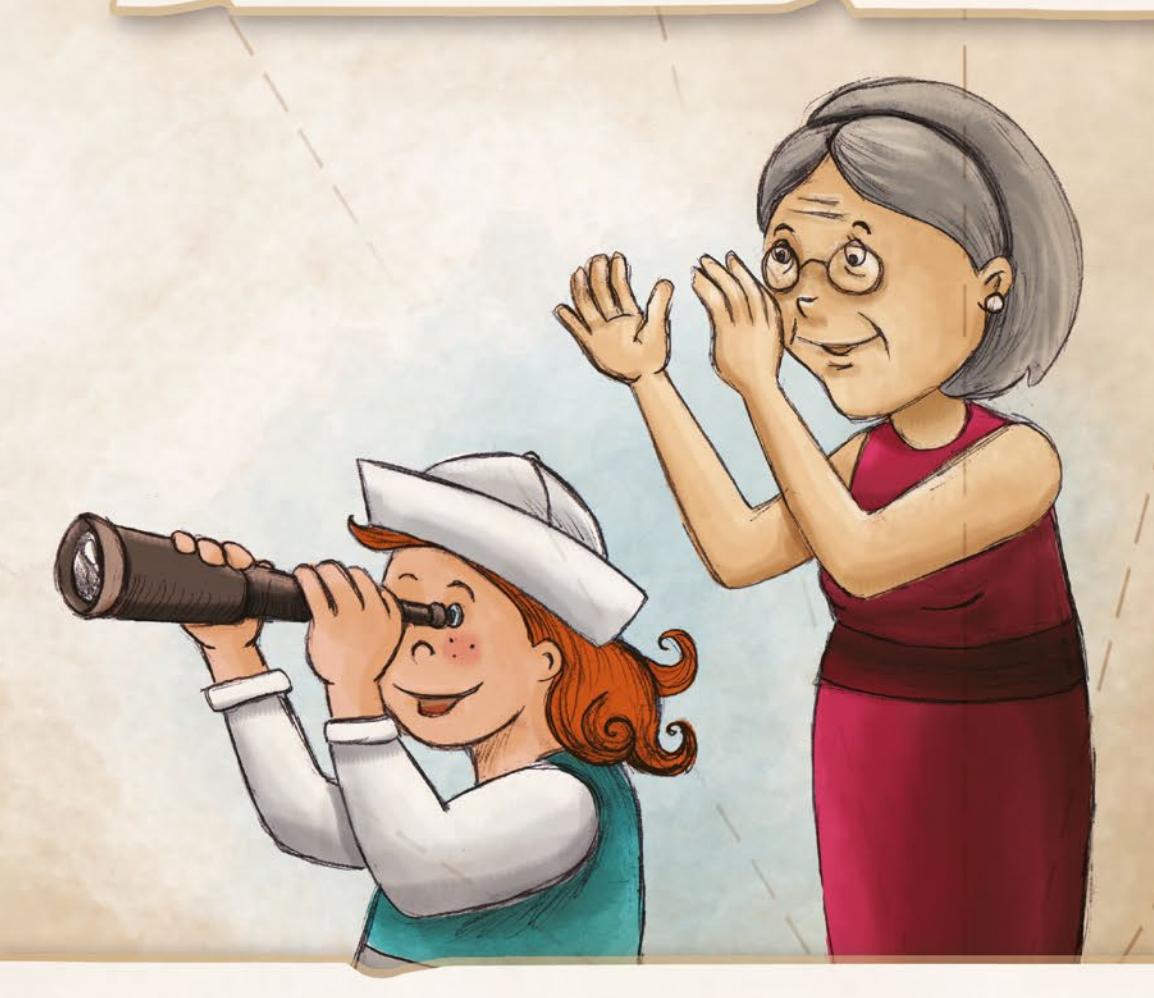
Illustration & design: Irène Lumineau

Inspired by Hanen Programs: It takes two to talko and You make the differenceo